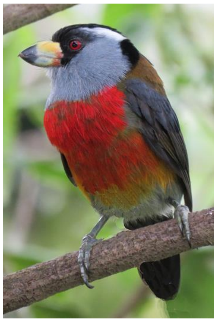
Toucan Barbet

Nestled in a dramatic, prime montane cloud-forest setting, Séptimo Paraíso not only offers comfortable accommodations, excellent cuisine and some of the best birding opportunities to be found in the area, but it's also strategically located to allow easy access to the key birding sites in this important bioregion. We will take good advantage of each day, working exceptional locations including Milpe Bird Sanctuary and Milpe Gardens, Amagusa Reserve, Refugio Paz de las Aves, and the "Paseo del Quinde" Ecoroute, among other important locations. We will also transfer over to the fairly new Kapari Lodge where access to lower elevation habitats and species is our goal; from here we will visit Río Silanche Bird Sanctuary, and of course bird the grounds at this site, with the possibility of visiting other nearby areas. In all, this northwest Andean region is the domain of Plate-billed Mountain-Toucan, Toucan Barbet, Moss-backed Tanager, Powerful & Guayaquil woodpeckers, Scarlet-breasted Dacnis and over 40 hummingbirds and an equal number of tanagers, among more than 500 possible Neotropical avian specialties, with promises of unforgettable experiences for all.