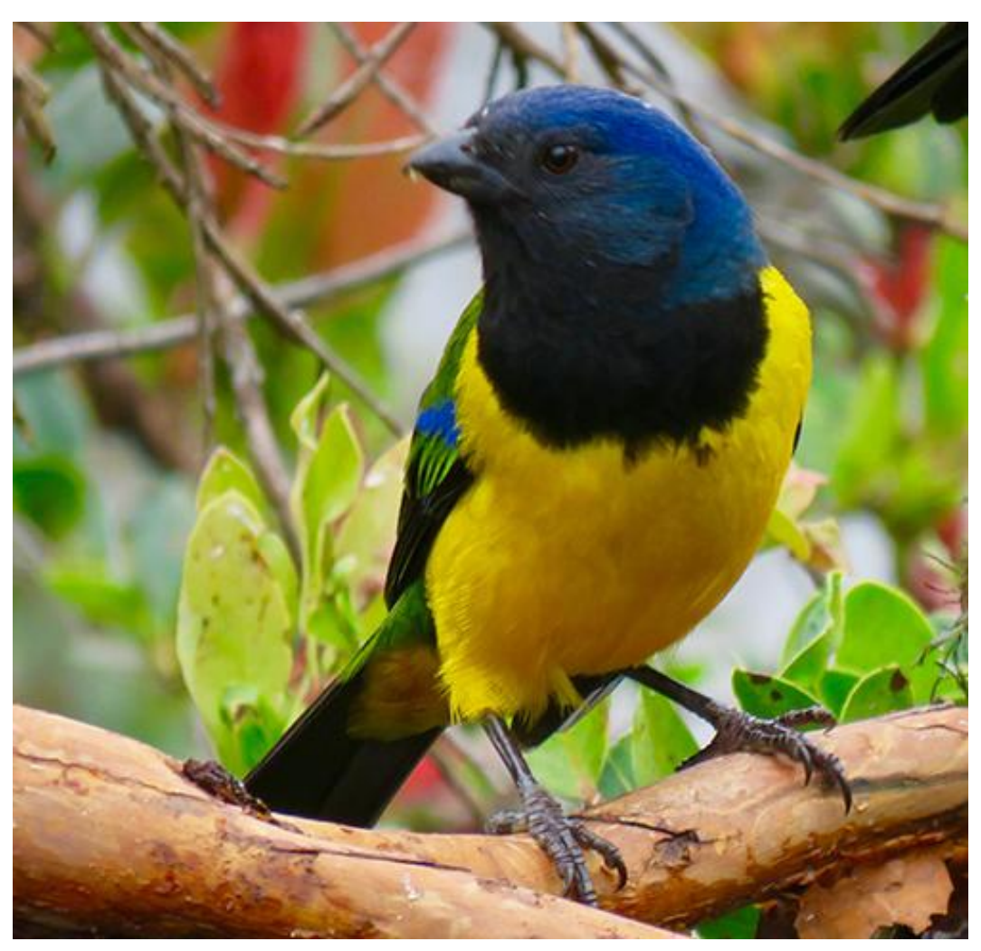
Black-chested Mountain-Tanager

This Eco-route is a 30-mile long, little-traveled country road that has been converted into a community-based, conservation-through-ecotourism pilot project designed by the Mindo Cloudforest Foundation. Here, three local communities co-manage the road for bird and nature tourism. They have a reforestation and waste-management program and are trained in the production of crafts and souvenirs, along with the know-how to provide various tourism and environmental services that will guarantee their wellbeing and improve their economies.