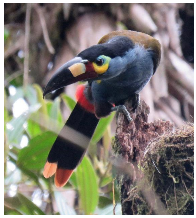
Plate-billed Mountain-Toucan

November 11-13, Days 3-5: Séptimo Paraíso Grounds and the Mindo-Milpe and Paseo del Quide EcoRoute Area. The Mindo Valley has become extremely well known over the last decade or so for its incredibly high biodiversity. While basing our "operations" out of Séptimo Paraíso, we will spend the next four days examining a wonderful selection of birding sites, exuberant roadside vegetation and forest trails, bird gardens, and forest reserves while searching for many of the nearly 500 species possible here. The lush, epiphyte-covered forests with their entangled understories seem to come to life in an instant. Bursts