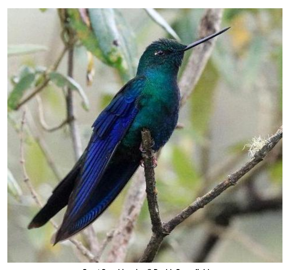
Great Sapphirewing

November 10, Day 2: Quito to Yanacocha Reserve; Then Continuing Along the "Paseo del Quinde" Ecoroute to Séptimo Paraíso. This morning we will have an early breakfast and depart from Quito to wind our way over the northwestern flank of the massive Pichincha Volcano to the Yanacocha Reserve. At over 11,000 feet in altitude, Yanacocha (960 hectares; owned by the Jocotoco Foundation) Reserve's main goal is the protection of the very rare, critically endangered, and endemic hummingbird—the Black-breasted Puffleg. This absolutely beautiful area—with its commanding views of "Guagua" Pichincha Volcano and its deep gorges covered in lush elfin forest—is a hummingbird hangout, simply buzzing with many high-elevation species.