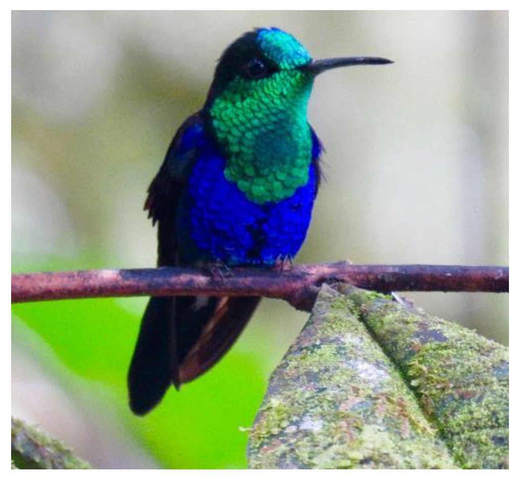
Crowned Woodnymph

November 18, Day 10: Departure for Home. Additional transfers will be provided to Quito's Mariscal Sucre International Airport for those passengers with departing flights today.